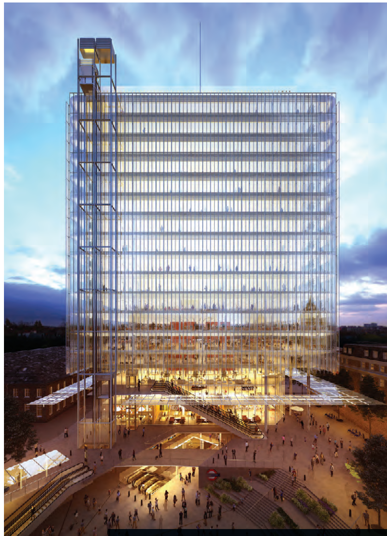
Paddington Square, London (Artist's impression)

The d'Leedon condominium is another property that is located close to Orchard Road. Jointly developed with CapitaLand, the property was designed by the late Pritzker Architecture Prize winner, Zaha Hadid. The unique design of the property defines the skyline, standing over a neighbourhood of good class bungalows. The property's prime location offers a clear view of the Botanic Gardens and allows residents numerous amenities and lifestyle options in the vicinity.