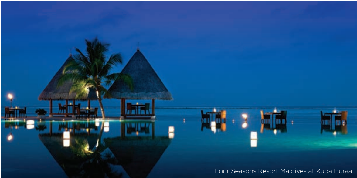
Four Seasons Resort Maldives at Kuda Huraa