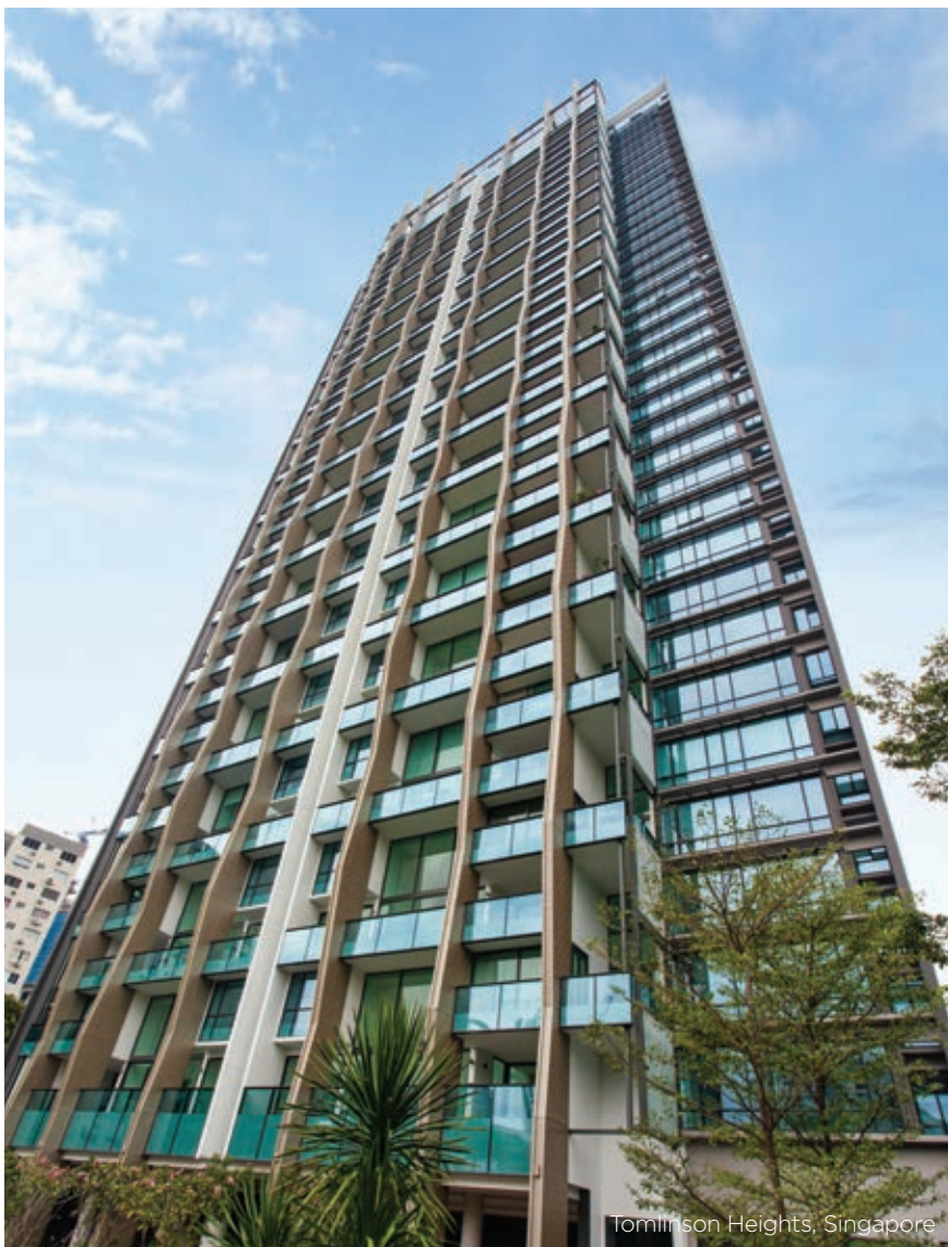
Tomlinson Heights, Singapore