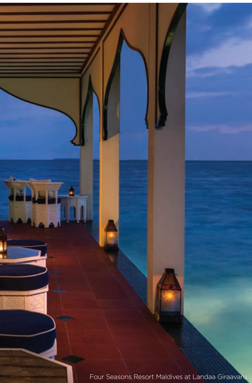
Four Seasons Resort Maldives at Landaa Giraavaru

The ultimate in beachside escapism, the Four Seasons Resort Maldives at Landaa Giraavaru includes a luxurious three-bedroom, two-storey Estate. This beachfront haven spans across 1,200 sqm of private quarters and features unobstructed ocean views of the surrounding Baa Atoll a UNESCO World Biosphere Reserve.