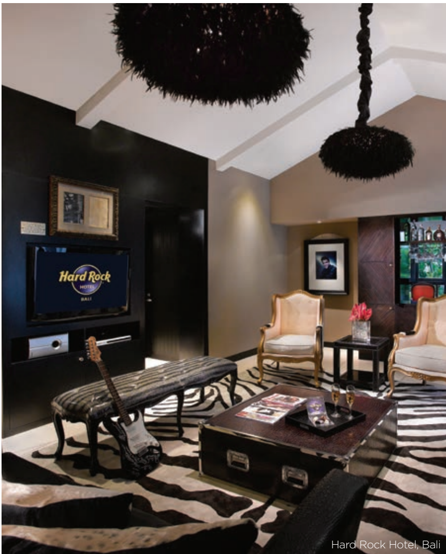
Hard Rock Hotel, Bali

On the eastern side of Africa, the Four Seasons Safari Lodge Serengeti continues to amaze guests with its spectacular views of the plains and wildlife. Situated in the Serengeti National Park of Tanzania, a UNESCO World Heritage Site, this luxury lodge