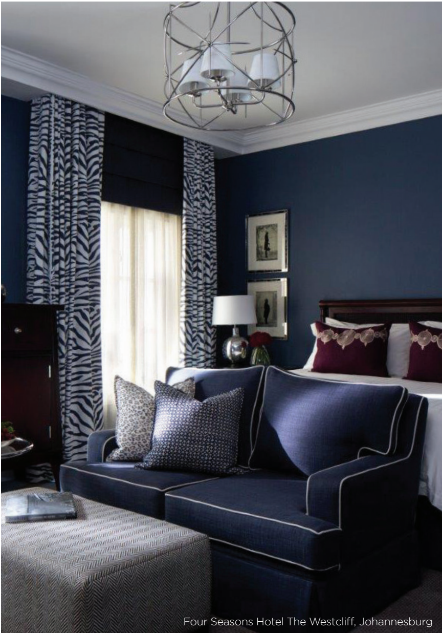
Four Seasons Hotel The Westcliff, Johannesburg