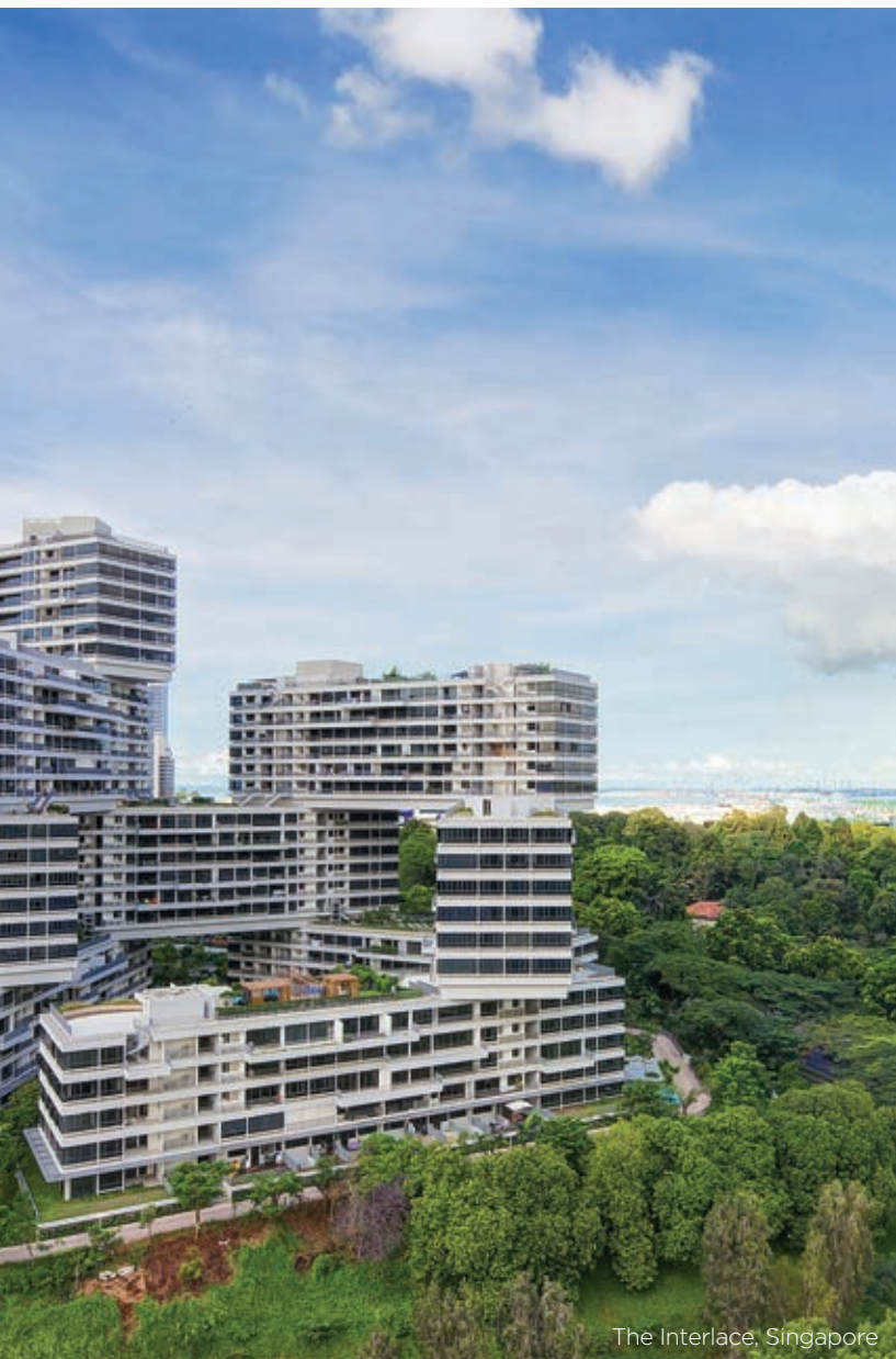
The Interlace, Singapore

The 30 Old Burlington Street project consisting of a freehold site in Mayfair,