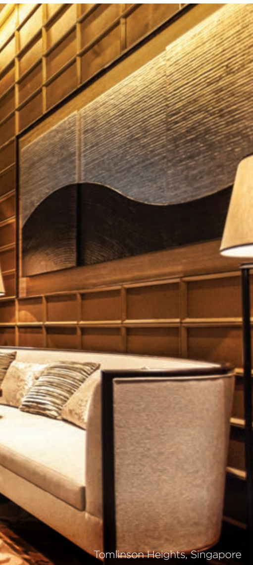
Tomlinson Heights, Singapore

development with CapitaLand. Designed by Pritzker Architecture Prize winner Zaha Hadid, d'Leedon condominium is the epitome of luxury. Surrounded by good class bungalows and highly coveted for its scale and prime location, d'Leedon condominium consists of seven 36-storey high residential towers and is renowned for its petering vertical silhouette with unobstructed sightlines of Botanic Gardens and the city skyline.