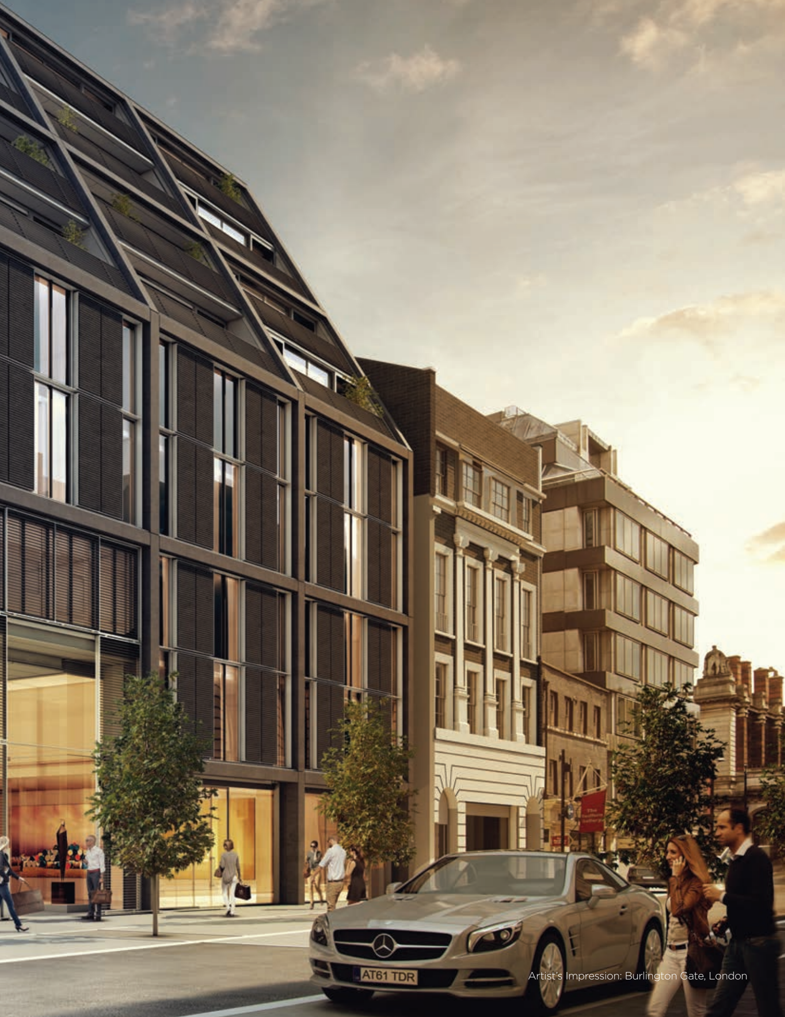
Artist's Impression: Burlington Gate, London