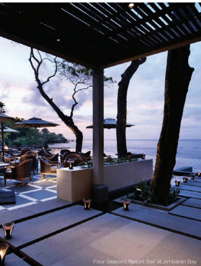
Four Seasons Resort Bali at Jimbaran Bay

The Hotel Division continues to strive to recognise, anticipate and satisfy the ever-changing needs of its discerning guests, and we are confident that the Division will continue to contribute strongly to the Group in 2015.