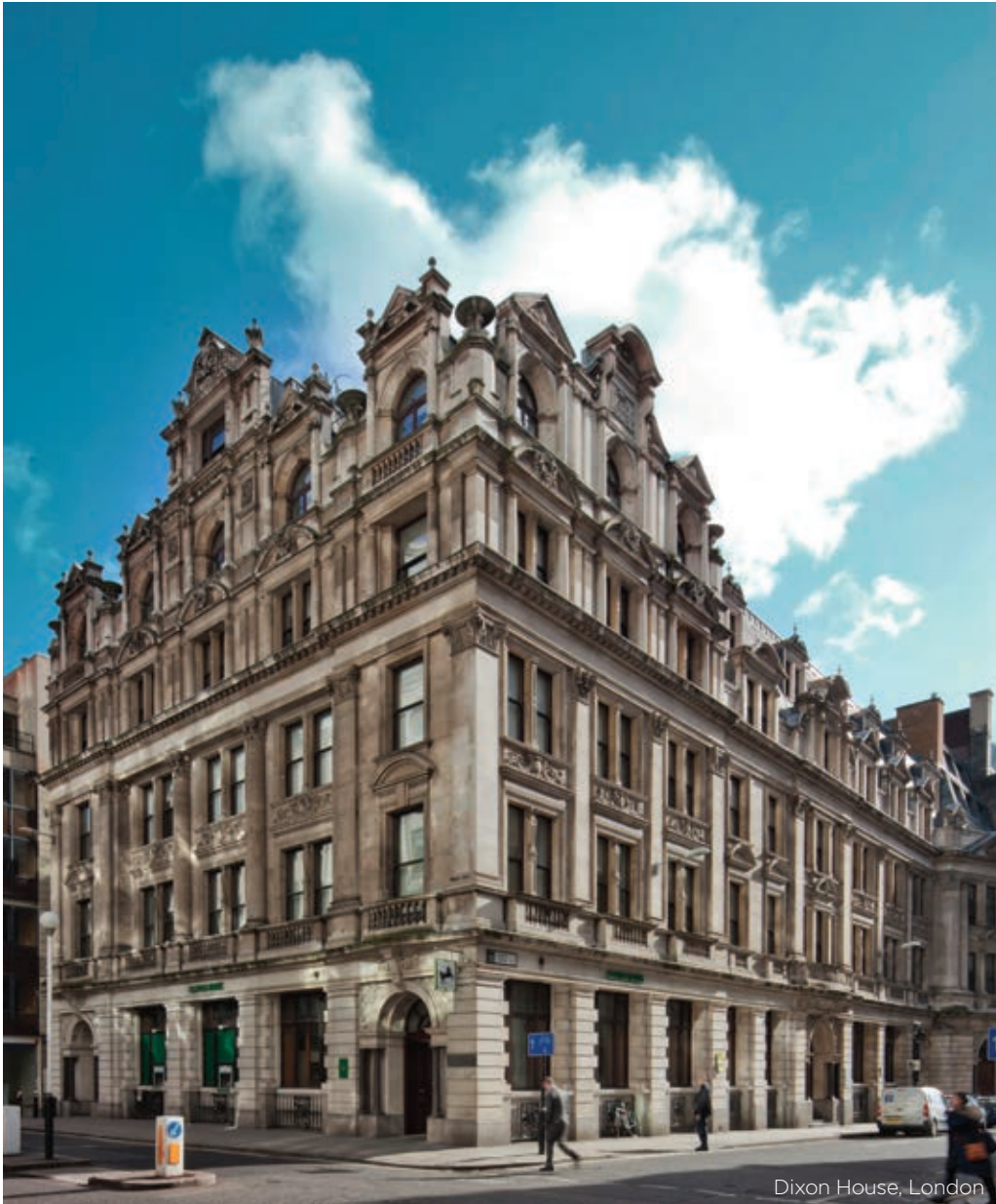
Dixon House, London

Thirty-one blocks consisting of 1,040 apartment units, each standing at six-stories tall and identical in length, are